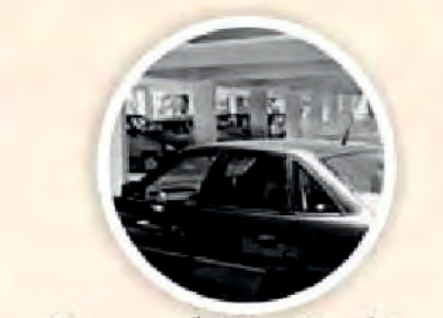
Covered Car Parking