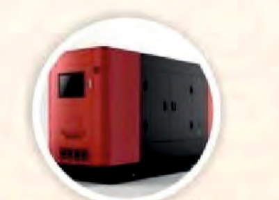
24x7 Power bkup